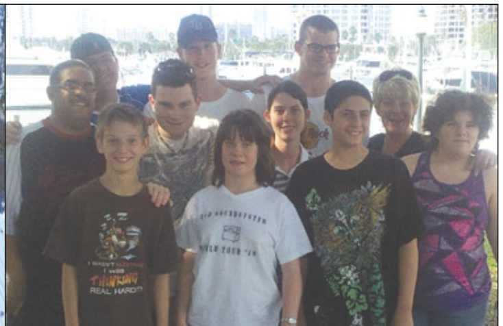
The STARS group on a picnic outing