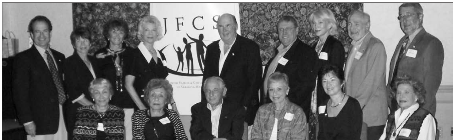
Honorees at the 2007 Annual Meeting