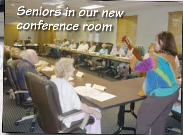
Seniors in our new conference room