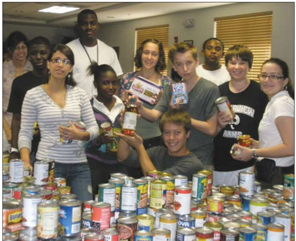
Local teens and JFCS staff sort donations, ensuring that needy families had food to eat this holiday season.